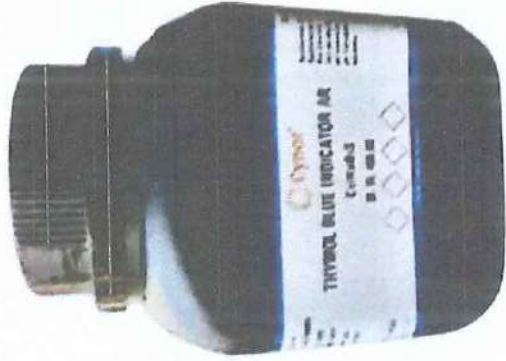
THYMOL BLUE INDICATOR