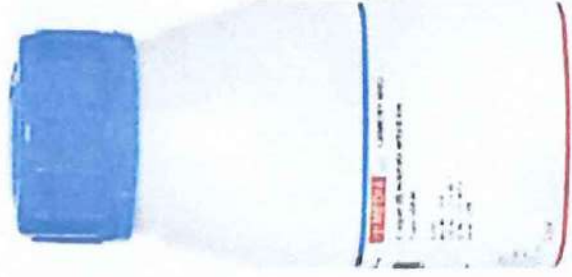
Copper (II) sulfate