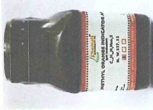
METHYL ORANGE INDICATOR