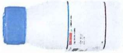
Egg albumin powder