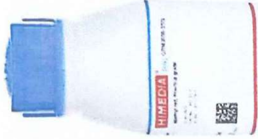
METHYL RED INDICATOR